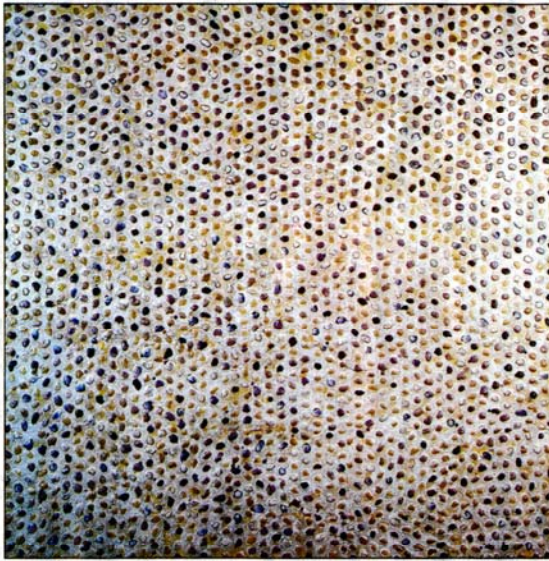
Brad Ellis arranged pebbles in an even grid pattern on "Pearl Drops 09-04," a 2009 encaustic and collage on canvas.