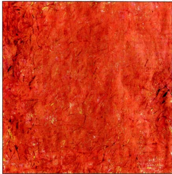
Brad Ellis generated a pattern of slashed and dripped paint on "Glory," a 2009 encaustic and collage on canvas.